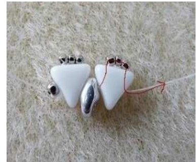
3) Insert 3 SB15 and exit HERE