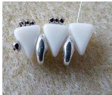
5) Continue to insert all the Khéops