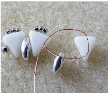
4) Insert 1 SD and 1 Khéops