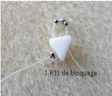
1) Insert 1 SB11, 1 Khéops and 3 SB15