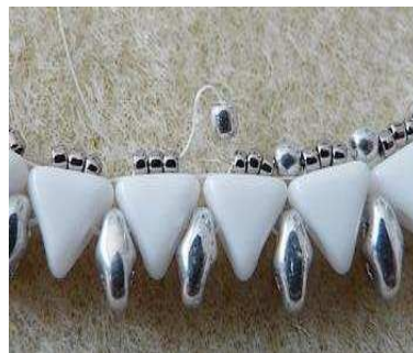
8) Insert 1 RB2 (or 1 F2) between each group of SB15