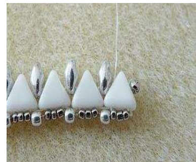
9) Insert 1 SB11 at the end