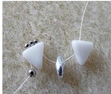
2) Insert 1 SD and 1 Khéops