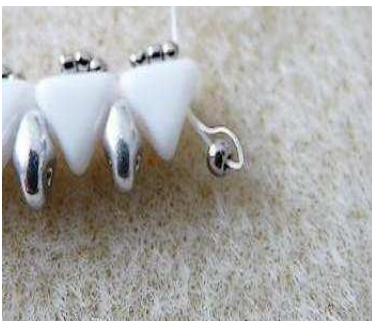
7) Insert 1 SB11 and pass again through the Khéops