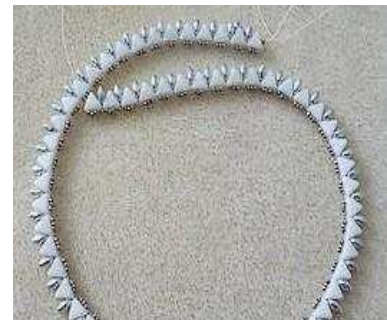
6) Here is the result 😊