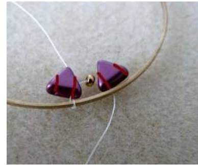
3) Insert 1 SB11 and 1 Khéops