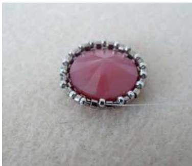
13) Make a round of SB15 peyote