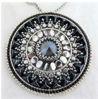
28) Another color