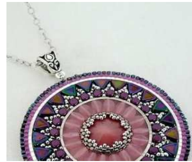
27) Place the bail. Compliments ! You have finished your pendant « Jian Pinch »