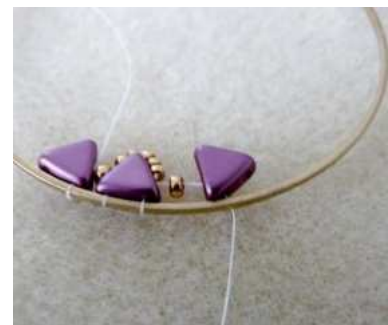
6) Insert 1 SB11 and 1 Khéops. All the way around 😊