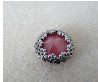
15) Here is the result 😊 Star setting