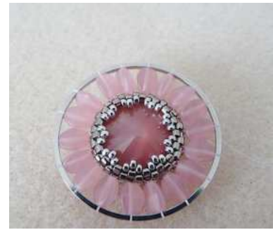
18) Insert 18 Pinch