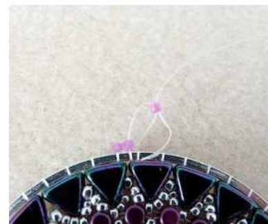
24) Insert 1 DB11. Pass under the circle and go up through DB11. All the way around 😊