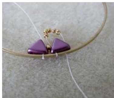
5) Insert 5 SB15 above the Khéops. Pass again through the Khéops (2 d hole)