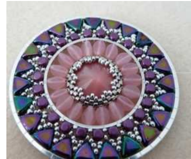
21) Here is the result 😊 You can finish like this or continue by adding another row of delicas in Brick Stitch