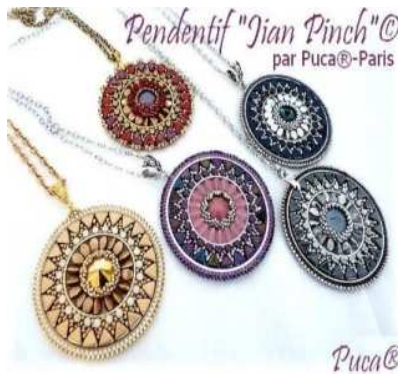
29) Another colors

I wish you a happy beading. I offer you this pattern.