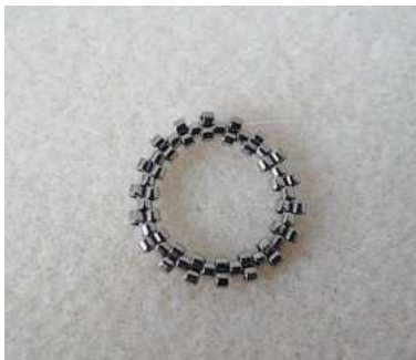
10) Make a round of DB11 peyote