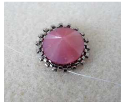
12) Insert the Rivoli 😊