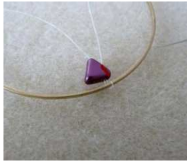
2) Insert 1 Khéops