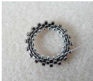
11) Make a round of SB15 peyote