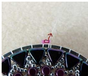
23) Pass again in the 2 DB11