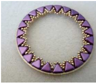
7) Insert 23 Khéops