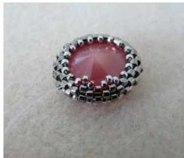
14) Insert 1 SB15 between 2 SB15 then pass through the next DB11.