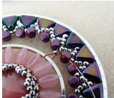
20) Pass again through the SB15 then through the next Minos. All the way around 😊