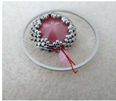
17) Insert 1 Pinch. Pass under the circle then again through the Pinch and through the next DB11