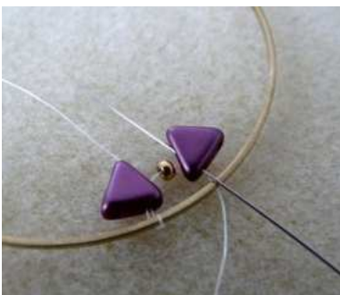
4) Pass under the circle then through Khéops