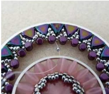
19) Assembly of the two circles : from the Minos insert 1 SB15 and pass under the circle with the Pinch