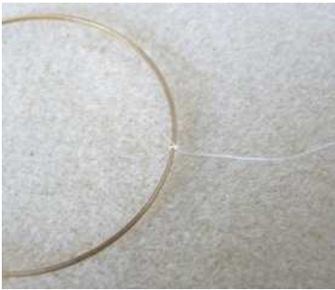
1) Make a knot on the circle