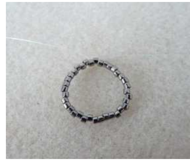
9) Second part : Setting the Rivoli. Insert 36 DB11 and close