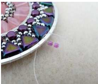
22) Insert 2 DB11 around the circle