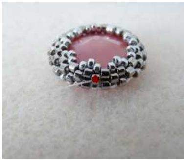
16) Exit through the second round of DB11 (central)