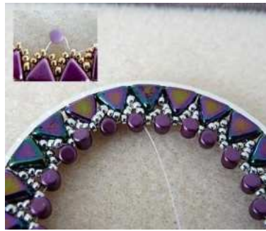
8) Insert 1 Minos between central SB15 You have finished the first part 😊